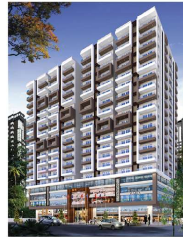
S.K.SIGNATURE SHOPPING CUM RESIDENTIAL AT GAGANPAHAD MAIN ROAD, SHAMSHABAD.