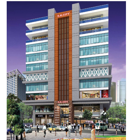
S.K.CITY SHOPPING MALL AT KANDLAKOYA, MEDCHAL