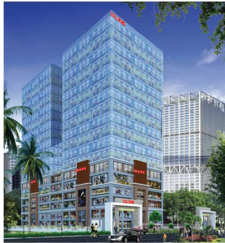
S.K.ONE AT GAGANPAHAD, SHAMSHABAD, HYD