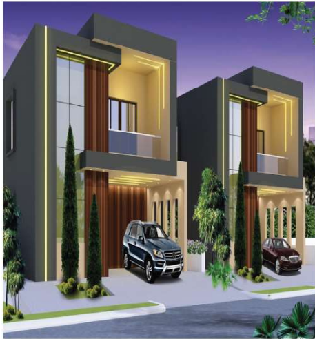
S.K.GREEN VALLEY AT NEXT TO RAMOJI FILM CITY , ABDULLAPURMET