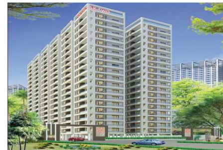
S.K.TWO AT GAGANPAHAD MAIN ROAD SHAMSHABAD