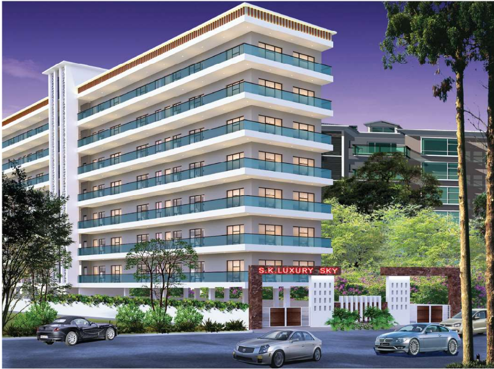
S.K.LUXURY SKY AT GAGANPAHAD MAIN ROAD, SHAMSHABAD