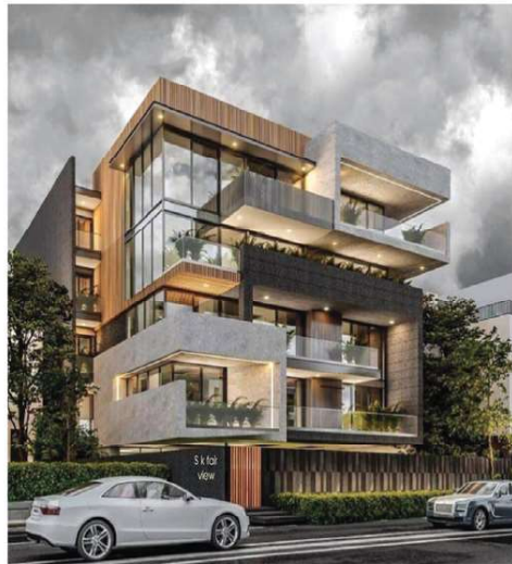
S.K.FAIR VIEW AT KAVERI HILL, HYDERABAD