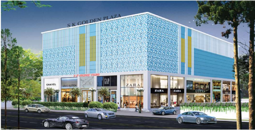
S.K.GOLDEN PLAZA COMMERCIAL BUILDING AT NEXT TO RAMOJI FILMCITY, ABDULLAPURMET