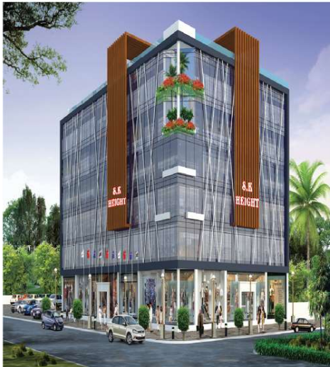
S.K.HEIGHT AT VIDYA NAGAR, HYDERABAD