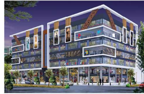
S.K.PLATINUM SHOPPING MALL AT GAGANPAHAD MAIN ROAD, SHAMSHABAD.